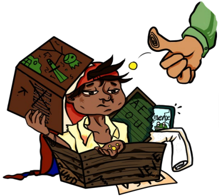
Reading Skills Problem