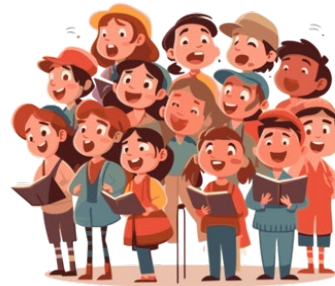
Cantata-version Reading activities/Group Story telling