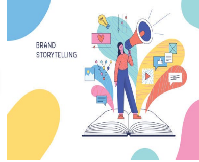
Describe and Draw