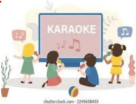
Literary-Musical Activities to enhance Reading/Speaking skills