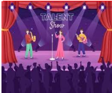
Got Talent Activities