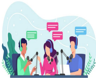
Radio Broadcasting-to enhance Reading and speaking skills