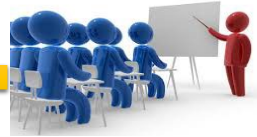
NSTP volunteers assist learners on Reading with Comprehension and other Reading activities through partnership