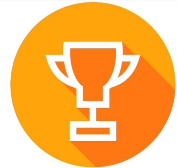
Weekly Targets Set