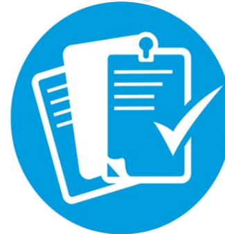
Individual Learning Progress